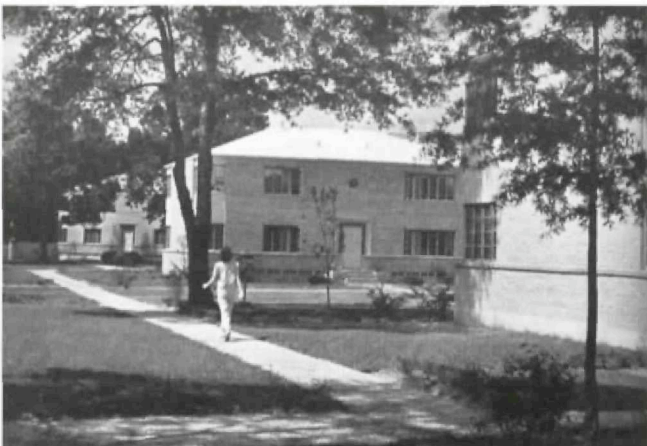
The Parklane Apartments as they looked on their opening in 1940. Since demolished.

The garden and its buildings are gone now, banished by development. Today, the Parklane is the name of a high-rise condominium that stands on the southeast corner of the property on about five percent of the land. The rest is razed, empty, and grown over, behind a high wire fence. What the fence keeps in and keeps out, I can't imagine. But when I drive by now, I feel like I am passing the scene of a terrible accident in which many, many lives have been lost, including some of my own. ■