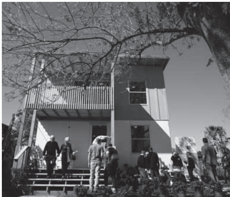
Tour goes on the patio of the 99k House, under construction by Harvey Builders.

Harvey Builders managed to nearly complete the 99K House in 99 days. Though renderings have