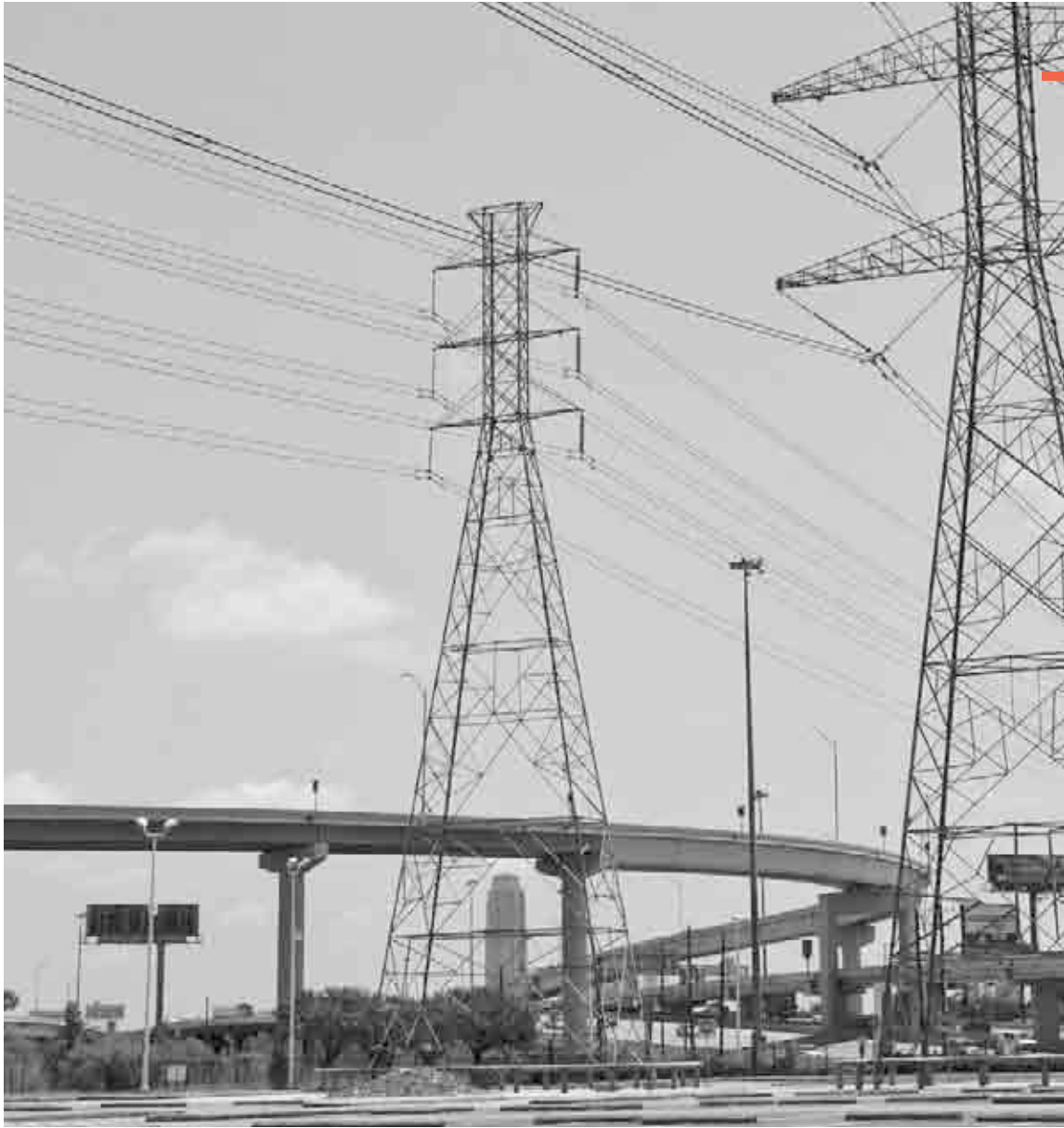
HILLCROFT TRANSIT CENTER AT ARMPIT OF THE SOUTHWEST FREEWAY AND WESTPARK TOLLROAD.