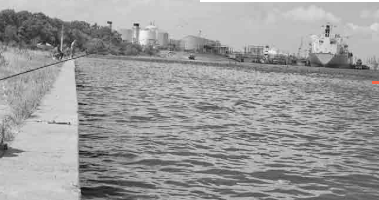
SAN JACINTO STATE PARK.