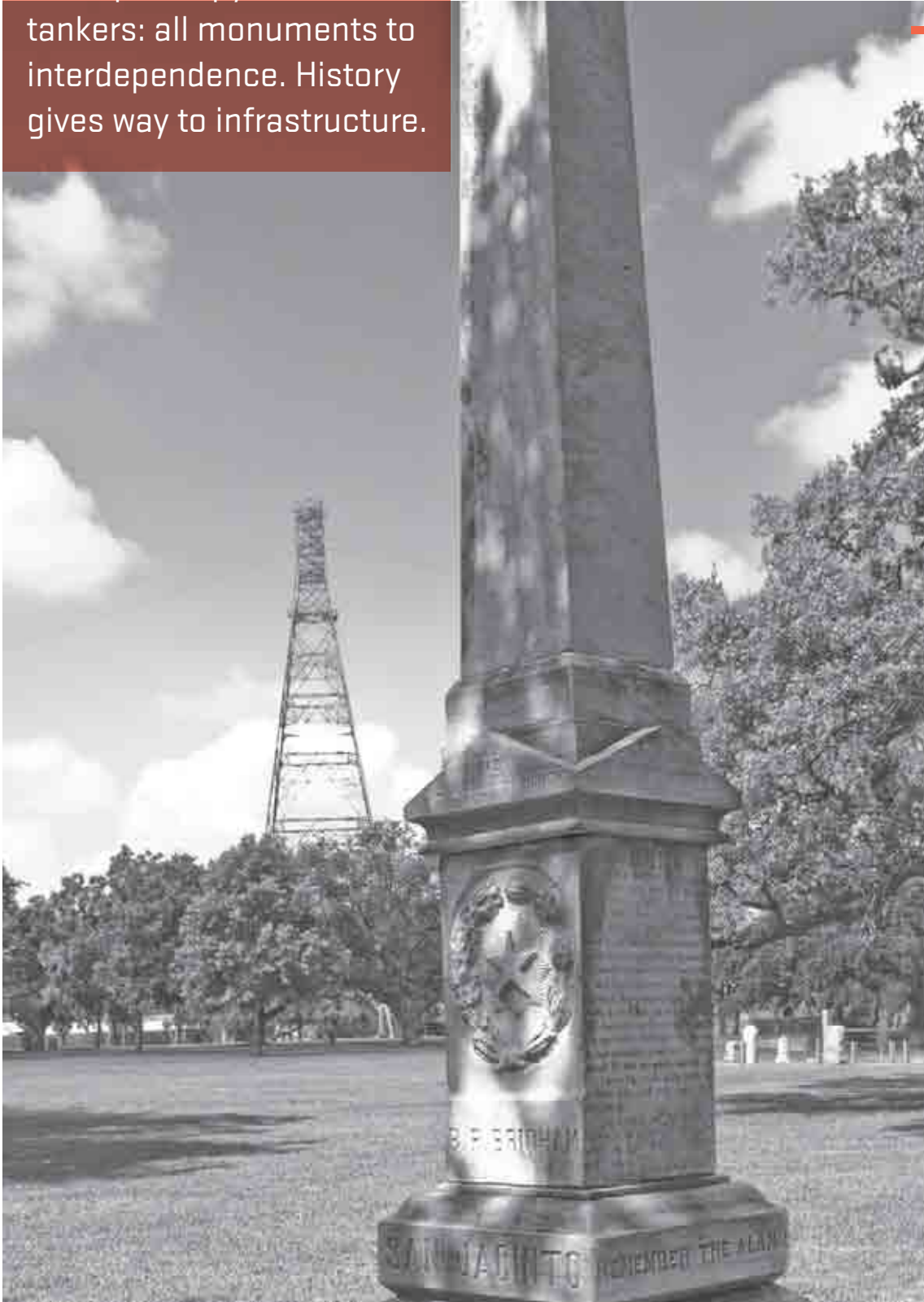
SAN JACINTO STATE PARK.

The "fields of honor" at San Jacinto are now surrounded by pipelines, rail lines, power pylons, and tankers: all monuments to interdependence. History gives way to infrastructure.