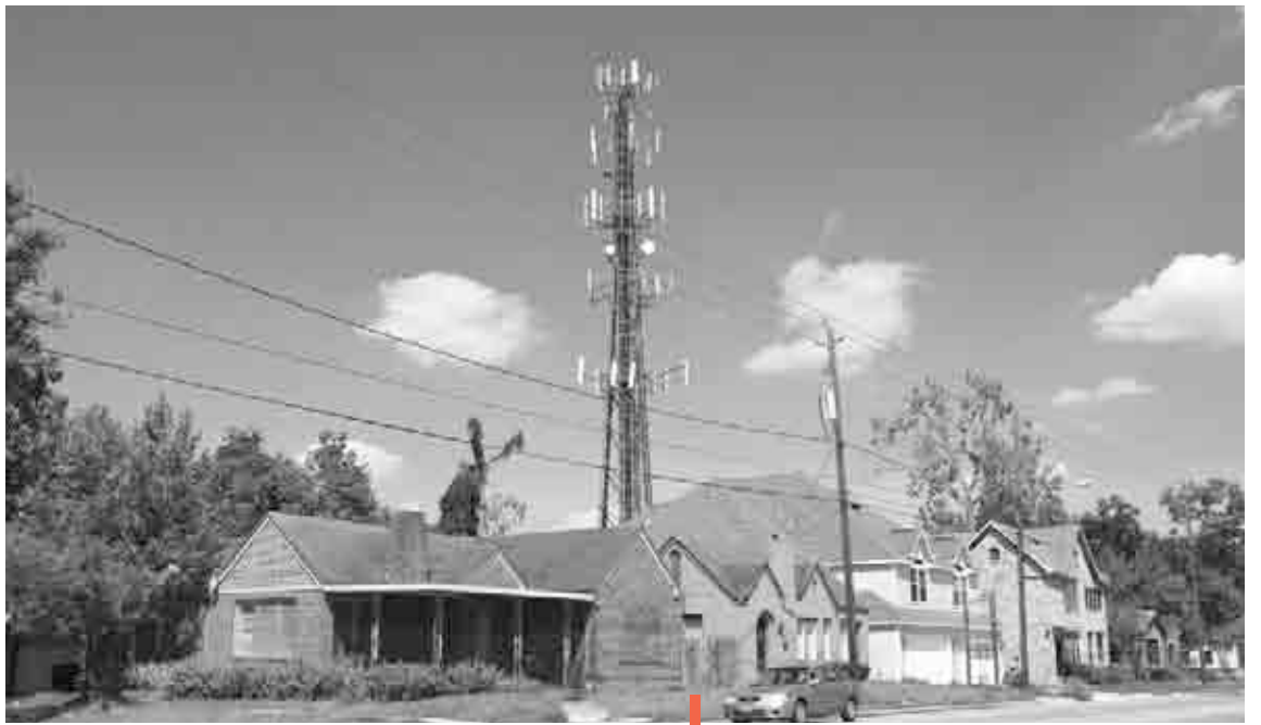
CELL PHONE TOWER, ALABAMA STREET BETWEEN HUTCHINS AND BASTROP STREETS.