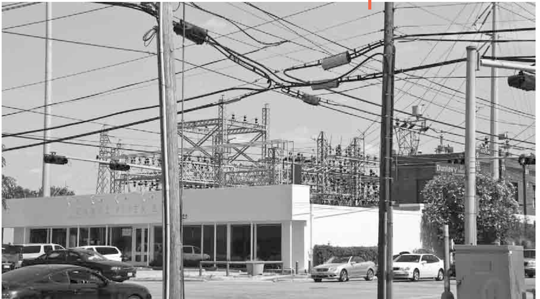
RIVER OAKS SHOPPING DISTRICT, WEST GRAY AND DUNLAVY STREETS.