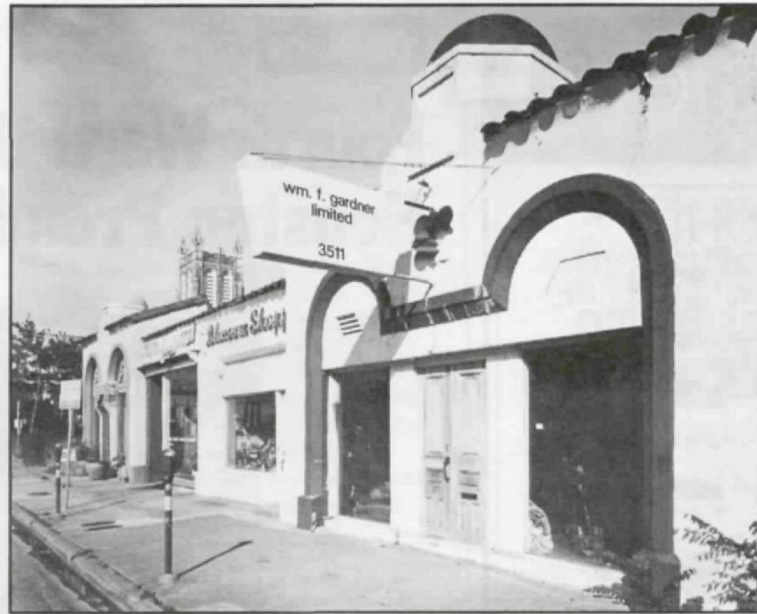
Hovas - Donovan Shops