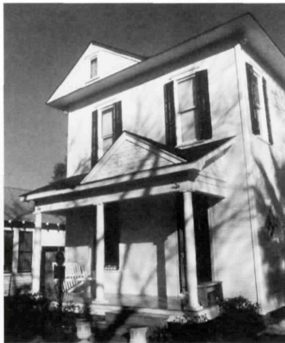
The 1905 Penn B. Thornton House in the Heights.

Have a criticism, comment, or response to something you've seen in Cite? If so, the editors would like to hear from you. You can mail your comments to Letters to the Editor, Cite, 1973 West Gray, Suite 1, Houston, Texas 77019; fax them to 713-529-5881; or e-mail them to citemail@rice.edu.