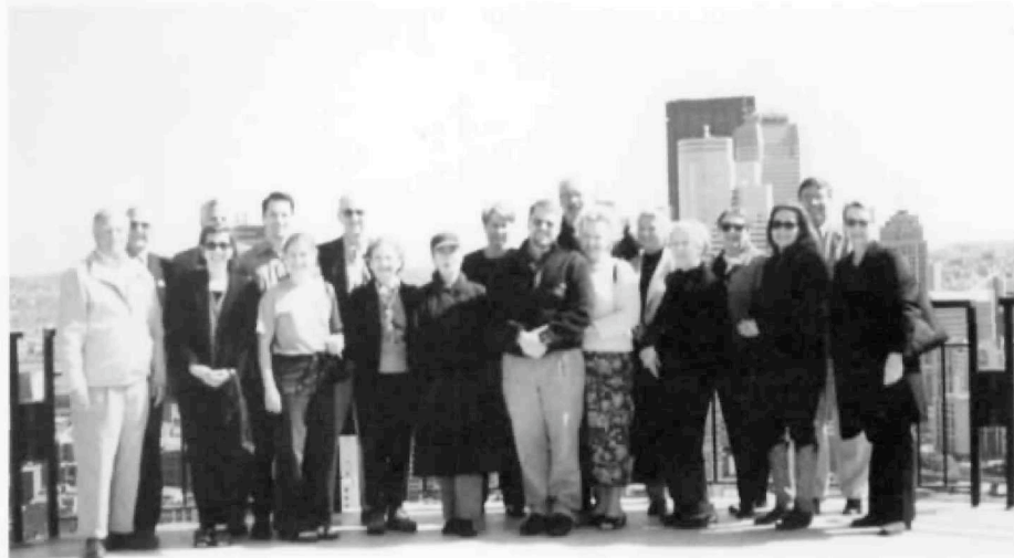
The RDA tour group at the Grand View on top of Mount Washington, overlooking the three rivers that converge at Pittsburgh.