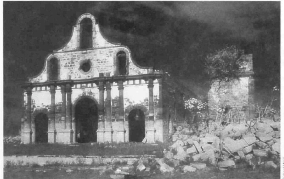
Templo de Nuestra Señora del Refugio, Guerrero Viejo, Tamaulipas.