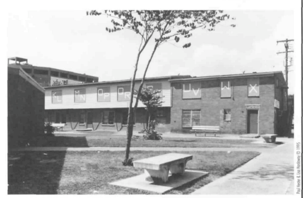
The daycare center at Clayton Homes. El Mercado del Sol is visible in the background.