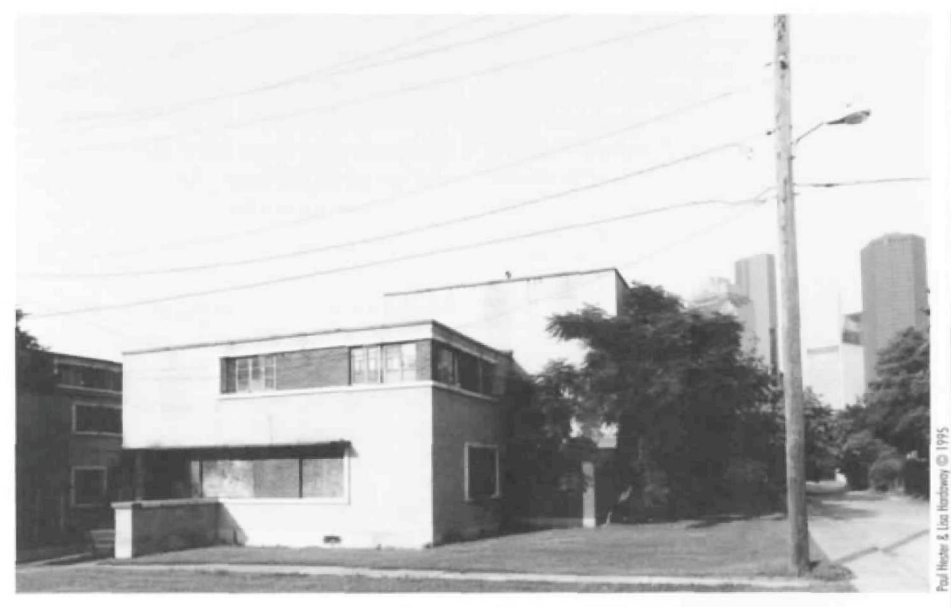
Allen Parkway Village, built in 1943 and designed by a group of architects led by MacKie & Kamrath.