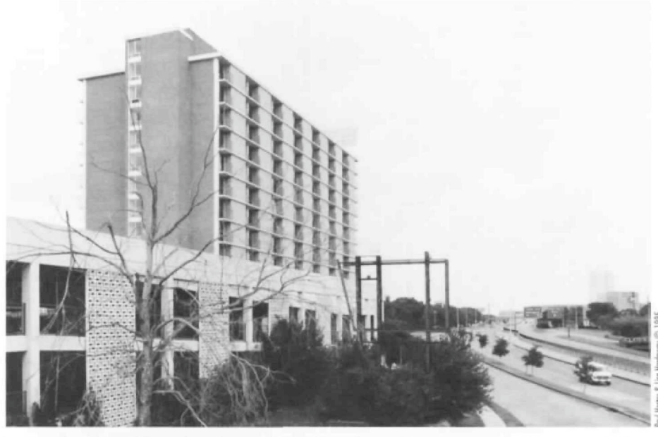
HACH sank more than $2 million into this former Holiday Inn on Memorial Parkway, even though it never owned the building. The public-private project was abandoned in 1989.

In 1990, HACH's 1970s investments in unsubsidized housing in the form of suburban apartment complexes, such as the