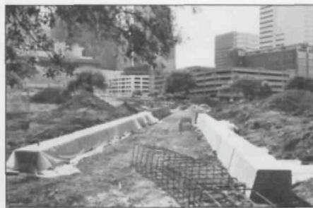
Walkways take shape at downtown's Market Square Park.

working together to evoke the past through chronology, documentation, and preservation, is nearing completion. Californians Doug Hollis and Richard Turner designed the diagonal walkways crossing at a plaza and paved with scavenged materials, giving the appearance of an archaeological remnant. Houston photographer Paul Hester is documenting the history of downtown and Market Square with 80 vintage photographic images baked onto enamel tiles for the garden retaining walls along the diagonal pathways. Curved benches designed by Austin native Malou Flato are tiled