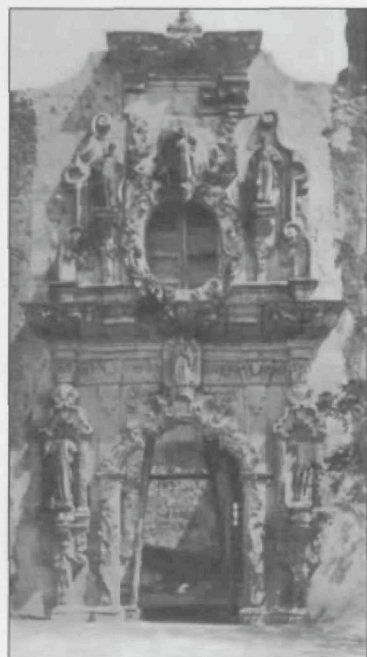
Misión San José y San Miguel de Aguayo, San Antonio, 1768-70.

713 639-7375 12 January – 12 April 1992 "The Main Street Exhibition," drawings, photographs, and architectural models resulting from intensive work by community architects, designers, students, professionals, and civic leaders to present practical and visionary solutions to the pervasive problems of Houston's Main Street.