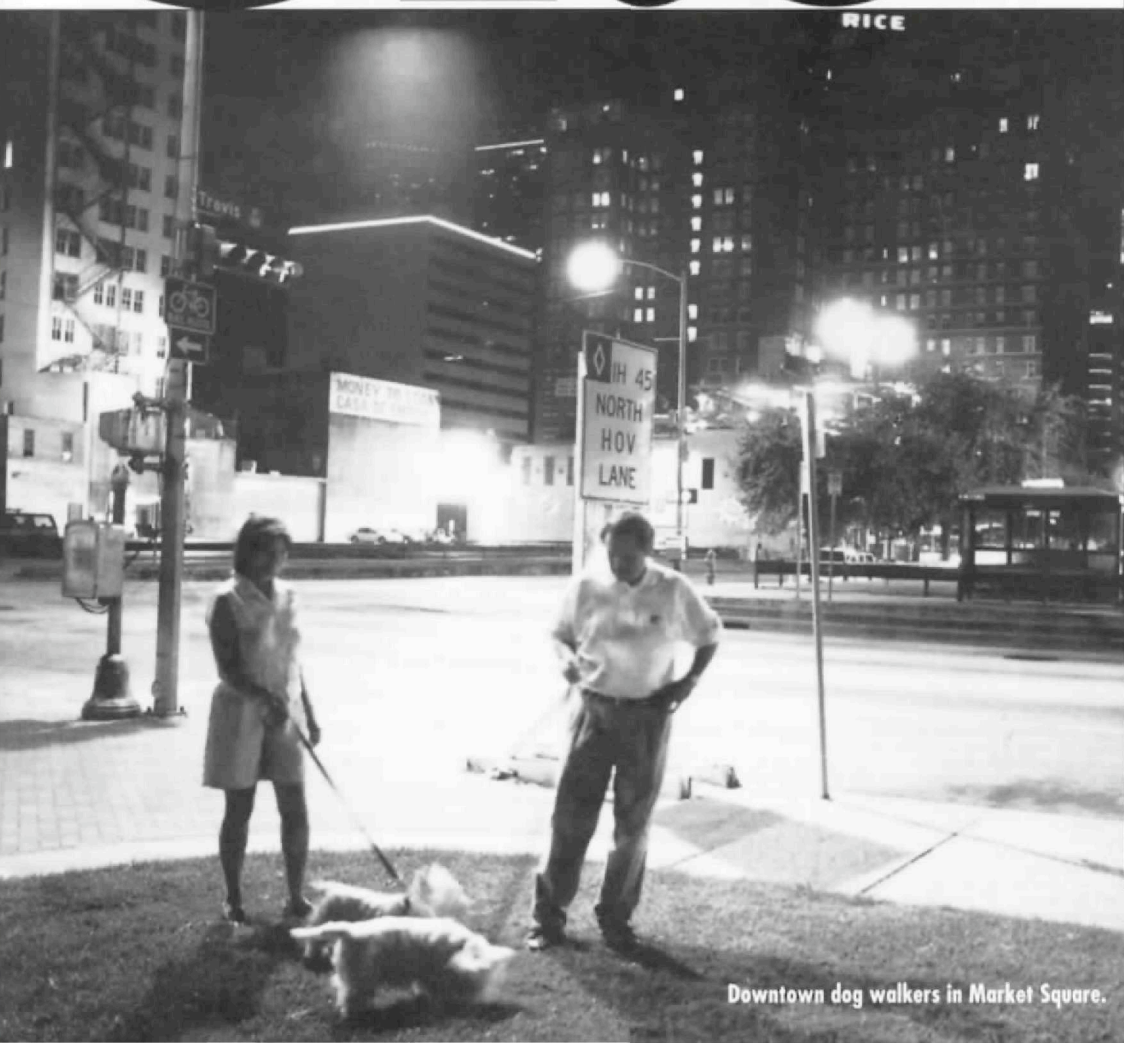
Downtown dog walkers in Market Square.