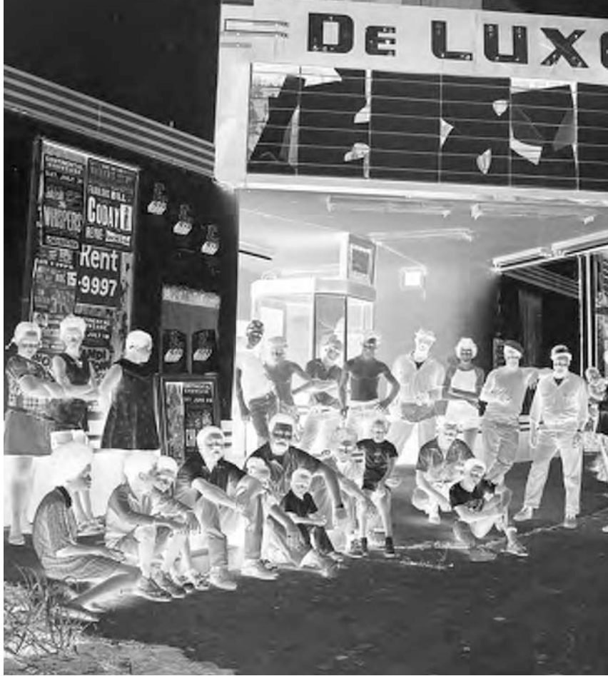
clockwise from top: De Luxe theater rehabilitation and exhibition participants; two works from Some American History exhibition; Rice Museum.