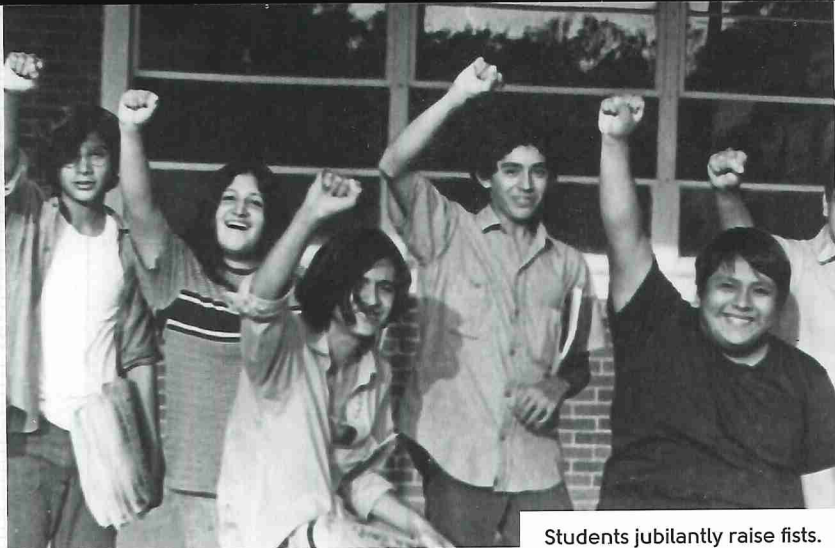
Students jubilantly raise fists.