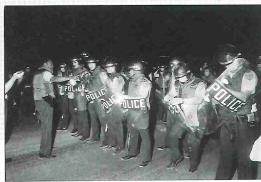
LEFT: Police amass at Moody Park to stave off the riots. BELOW: Firefighters attempt to put out the flames from a car overturned in the 1970 riots.