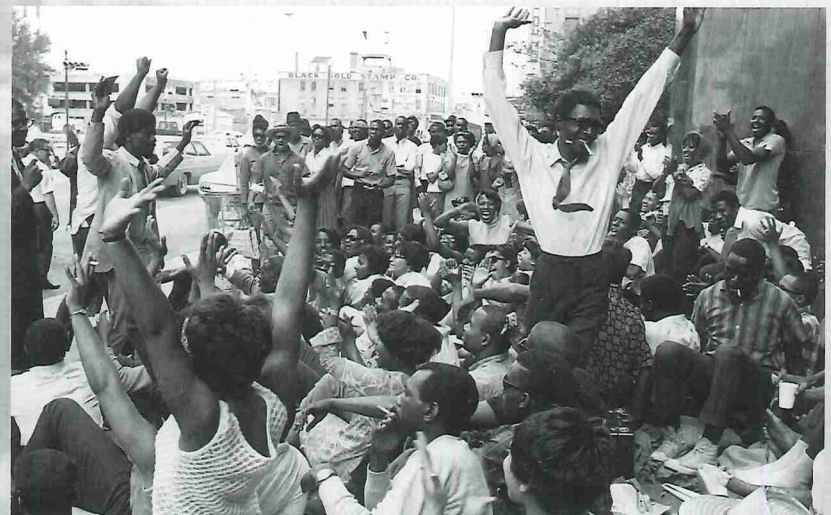
A crowd protests on April 6, 1967, in front of the Harris County Courthouse against the police crackdown on the TSU campus that culminated the next month.

In the late sixties, TSU student activists began organizing in new ways, their radicalization influenced by the Black Power movement and largely pushed along by a group of student activists identified as Friends of the Southern Nonviolent Coordinating Committee (SNCC). The students were protesting police brutality and seeking to shut down the portion of Wheeler Avenue that bisected the campus. A series of rallies in early 1967 (including one led by Stokely Carmichael) culminated in a police siege of TSU as the city sought to quell the increasing anger and organized protest on campus. On May 16, 1967, police invaded the campus. Students fought back as officers axed their way into dorm rooms and took everyone outside, beating many of them brutally. Police fired thousands of rounds of ammunition. By the end of the day, they had arrested 480 students and one officer was dead ( Time magazine said it was probably from a stray police bullet).