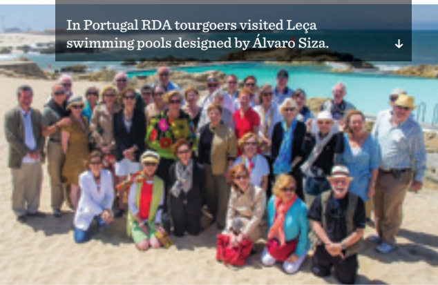
In Portugal RDA tourgoers visited Leça swimming pools designed by Álvaro Siza. ↓