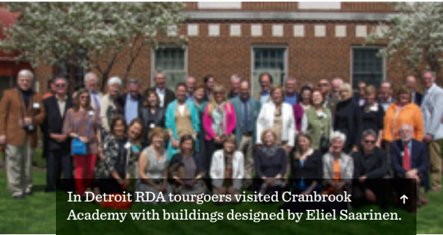
In Detroit RDA tourgoers visited Cranbrook Academy with buildings designed by Eliel Saarinen. ↑